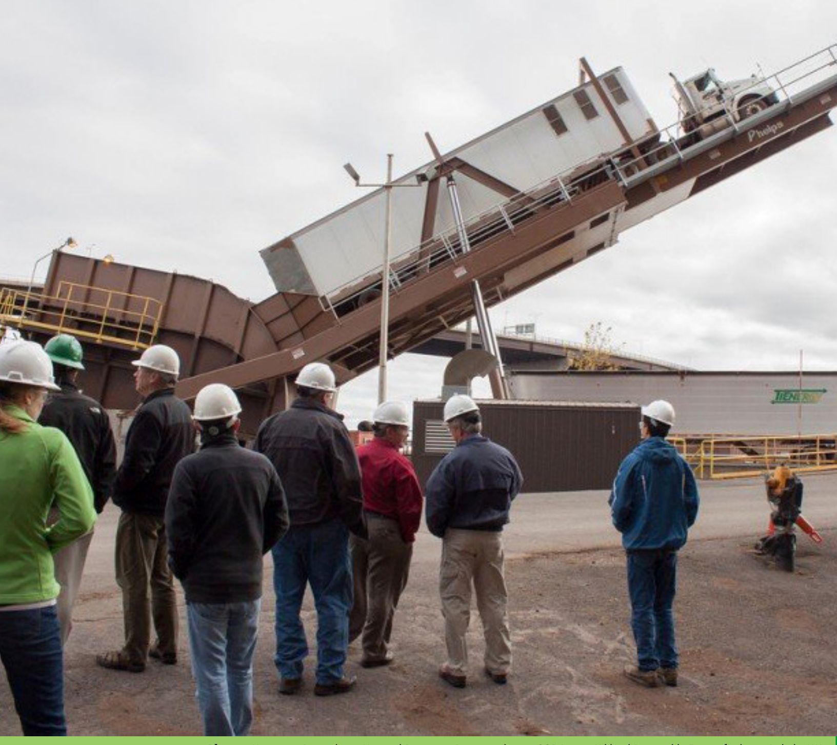
Above: Minnesota Power hosts National Bioenergy Day attendees in 2014 at its Hibbard Renewable Energy facility in Duluth, MN.