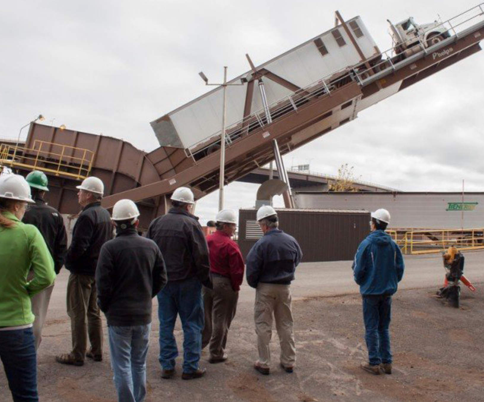
Above: Minnesota Power hosts National Bioenergy Day attendees in 2014 at its Hibbard Renewable Energy facility in Duluth, MN.