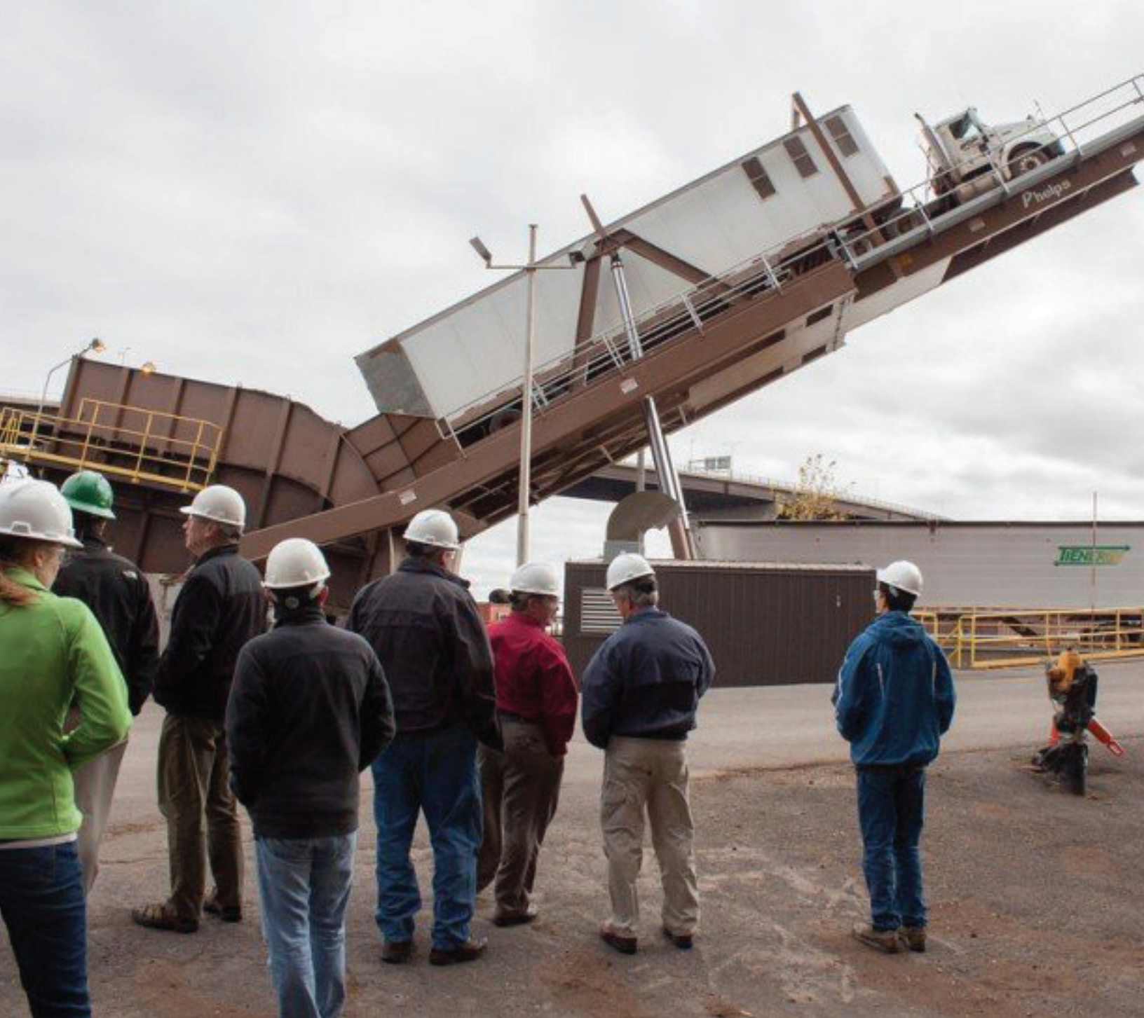
Above: Minnesota Power hosts National Bioenergy Day attendees in 2014 at its Hibbard Renewable Energy facility in Duluth, MN.